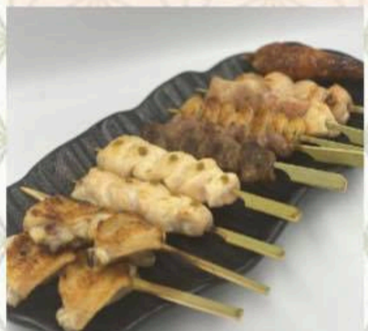
Omakase Chicken Skewers(10 Kinds)